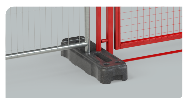
Rubber feet used to connect fencing and gate